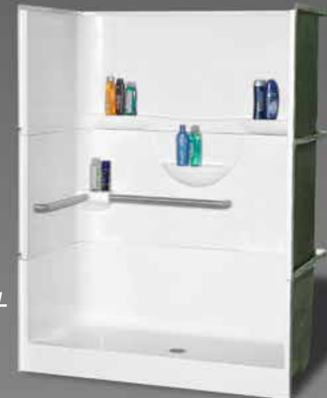
SH3P-6032 / BP1-60 L 3-Piece System