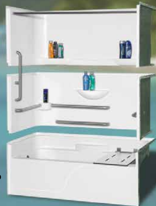
TS3P-6030L / ANS17-FLD (compliant bar & folding seat package)

Our innovative front-install VURSAkd systems eliminate the seam issues commonly associated with panel wall surrounds. Each component is positively locked together to create a continuous compression along the seam using our "patent pending" technology. Seam integrity and the rigidity of our assembly is further enhanced with each section being secured to the bathroom framing.