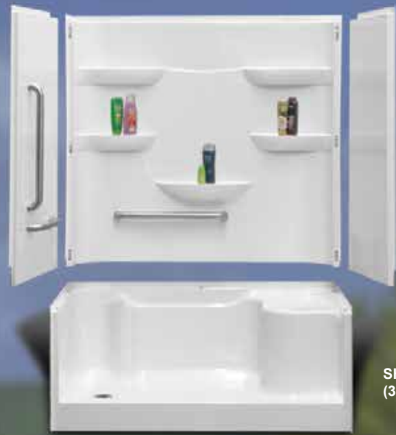
SH4P-6032 L-RS / BP2-60 (3-bar package)