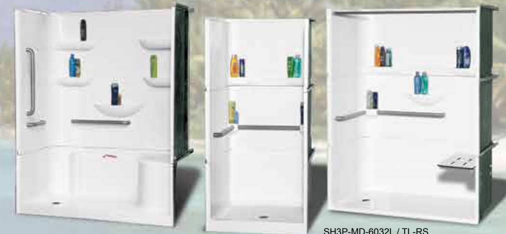
SH4P-6032L-RS / BP2-60