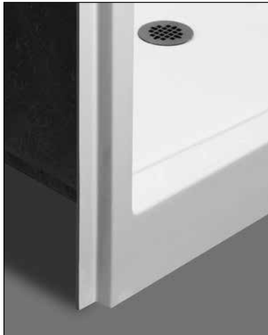
WX Wall Flange Detail