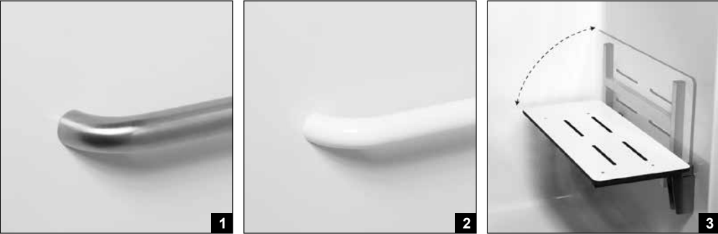
Photo 1: Grab Bars: Factory-installed 1.50-inch diameter, concealed attachment, 18 gauge, #304 brushed stainless steel grab bars. Concealed attachment design provides tamper-resistance and minimizes debris collection areas at contact points, compared to common exposed flange bar designs, without compromising bar attachment integrity. (Reinforced areas include a structural core material encapsulated in FRP composite.) Photo 2: Grab Bars: Factory-installed 1.25-inch dia. powder coated (in finishes listed above), concealed attachment, 18 gauge, #304 stainless steel grab bars. Concealed attachment design provides tamper-resistance and minimizes debris collection areas at contact points, compared to common exposed flange bar designs, without compromising bar attachment integrity. (Reinforced areas include a structural core material encapsulated in FRP composite.) Photo 3: Shower Bench Seat: Factory-installed shower bench seat with non-porous, high-pressure laminate upper and lower surfaces, fused to high-density phenolic core. The seat area secures to an 18 gauge, #304 stainless steel framework, and easily pivots upward to store along the wall without supplemental fasteners. Heavy-duty wall (hinge) bracket design eliminates supplemental legs and is formed from 10 gauge, #304 brushed stainless steel. (Reinforced area includes a structural core material encapsulated in FRP composite.)