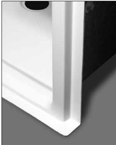
WXR Wall & Floor Flange Detail