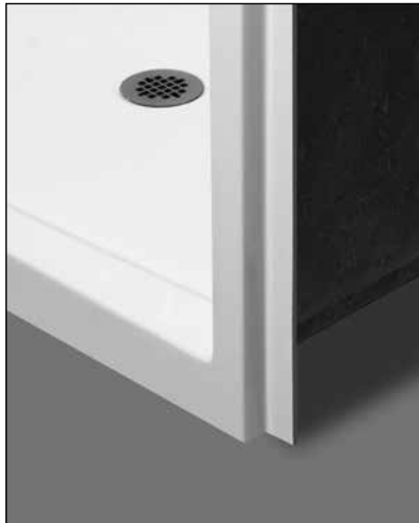
WX Wall Flange Detail