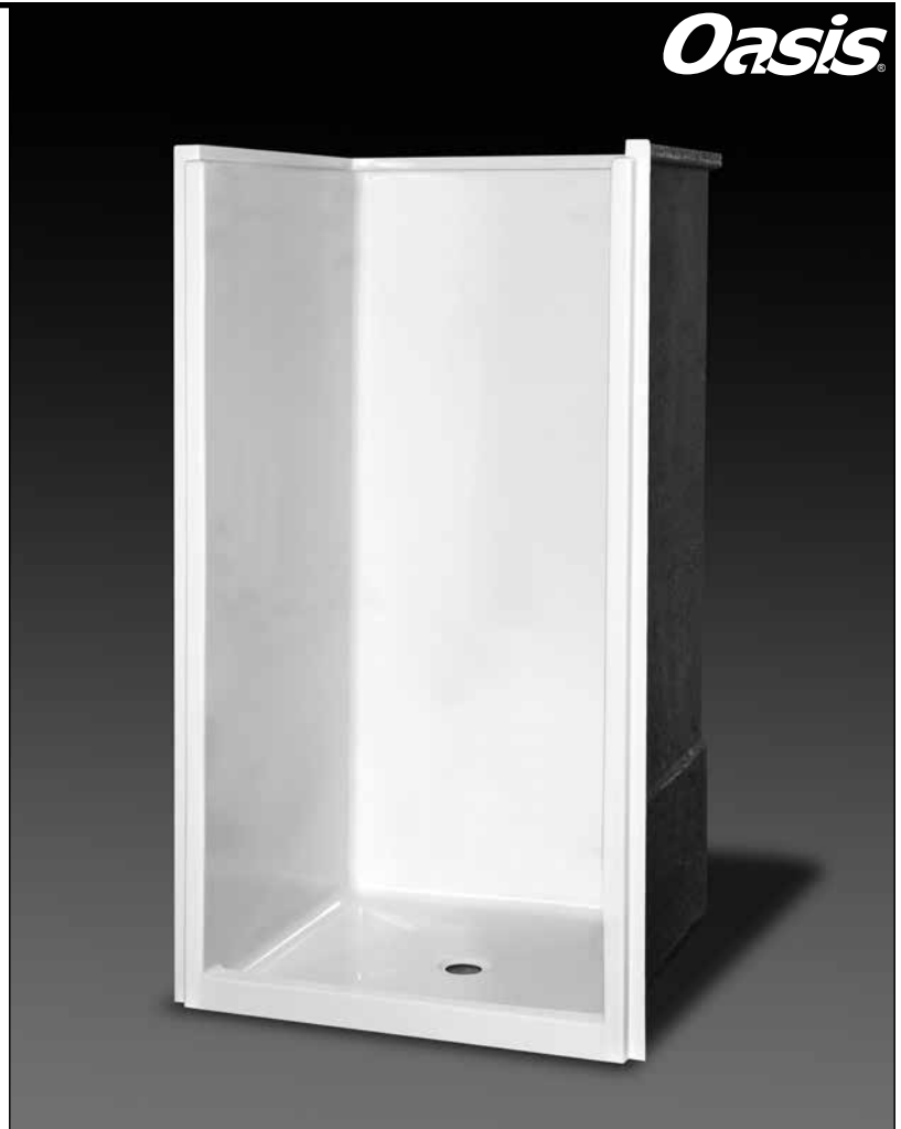
FLAT WALL MODEL