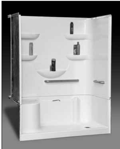
SH4P-6032R-LS / BP1-60 shown